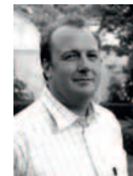
Arne Maynard is a leading garden designer based in London and Monmouthshire

A member of the teasel family, Succisella inflexa 'Frosted Pearls' has small, soft, silver-grey scabious-like flowerheads that lend themselves naturally to informal planting among other small-flowered perennials.